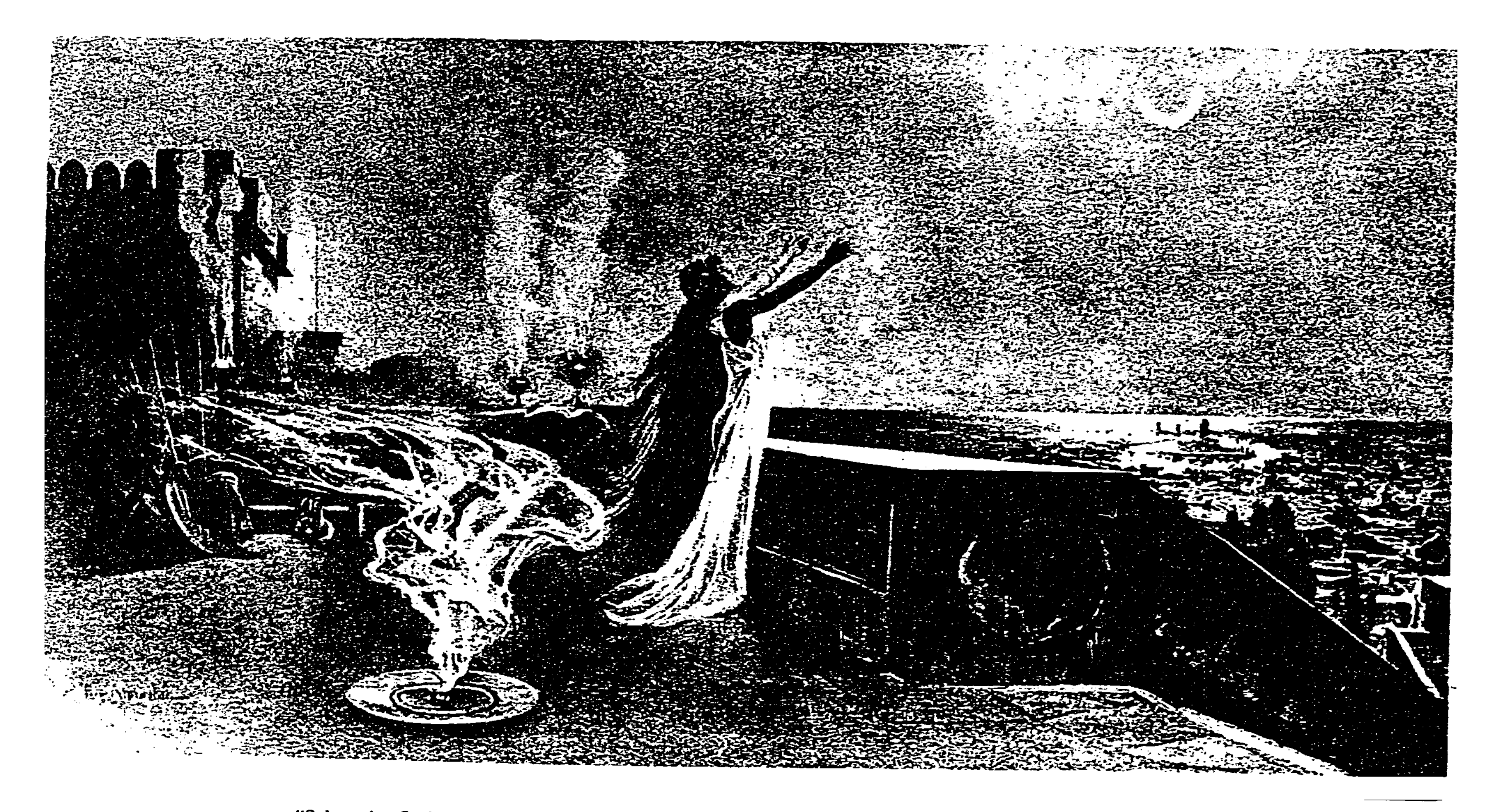
"Salammbo Seeks to Pierce the Secret of the Moon While Carthage Spreads Itself Below Her Feet."

carried out (us wishes and built the present Carthage, according to Applan, "not on the site of the old" one, but very near it, to avoid the ancient curse."