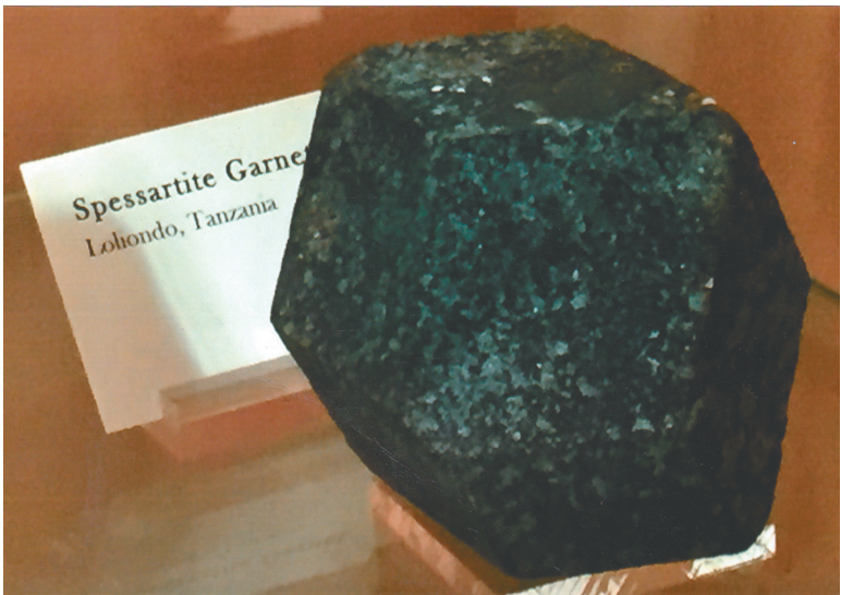
FIGURE 3: THE PATERSON SPECIMEN.

It sat on a low shelf in dim light next to a door, in the company of dozens or hundreds of other crystals which outshine it in beauty, but which pale in comparison with the garnet’s literary-historical significance. (See enclosed photographs.)