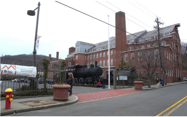
FIGURES 3 & 4: THE PATERSON MUSEUM.

Numerous attempts to confirm the provenance of this specimen have yielded only frustration. The Paterson Museum, while being a wonderful civic institution, is not a large one, and the friendly but overworked current staff have been unable to provide any records from the earliest days of the museum which would confirm whether or not this garnet was indeed part of the collection back in 1925. It may well be that no such records exist to be found. But knowing Lovecraft's penchant for weaving real-life objects and experiences into his fantastic fiction, I decided to put audacity before caution in bringing this matter to the Society's attention.