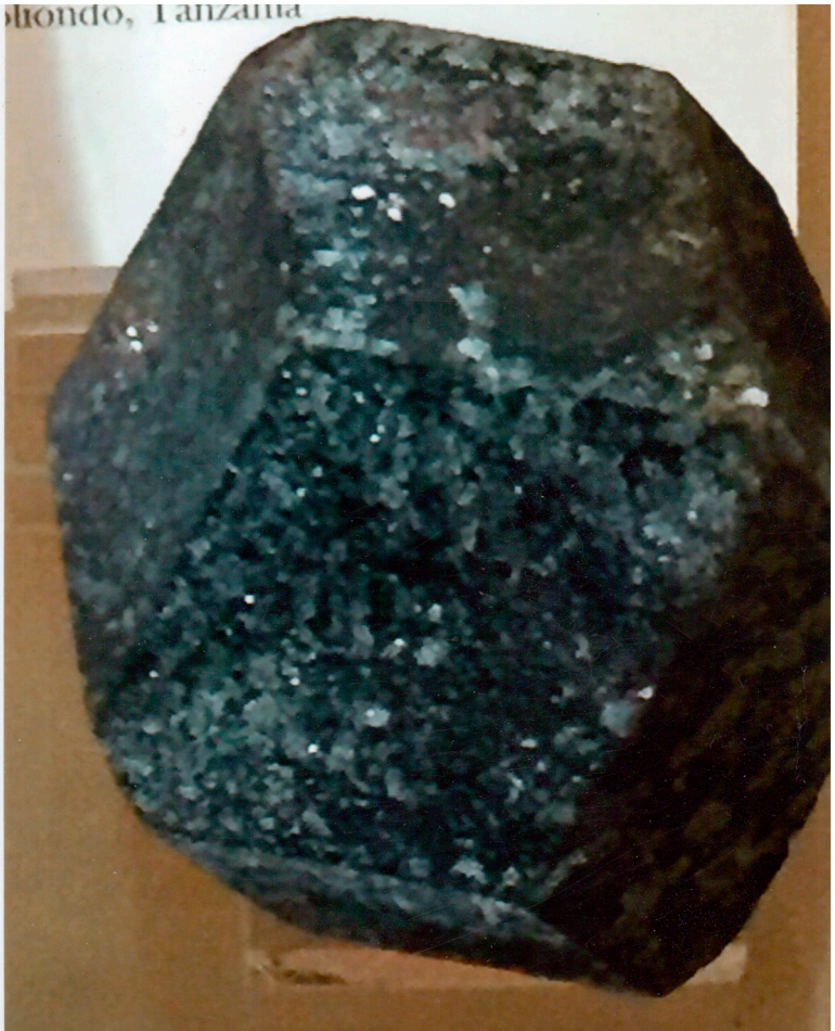
FIGURE 5: THE PATERSON SPECIMEN.